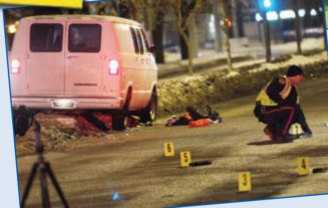
The Brandon Sun