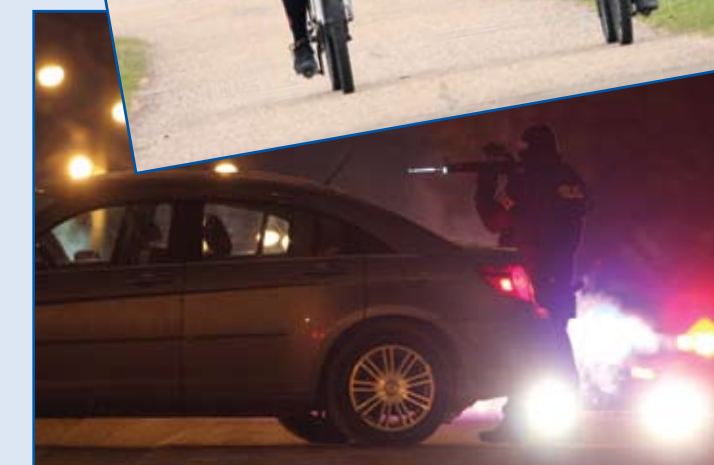
The Brandon Sun

...was very impressed by how you were able to deal with what could be described as a "violating experience" with grace and a sense of humour. She also thought you both perform "great work" by detecting and apprehending the persons responsible before they discovered they were a victim of a crime.