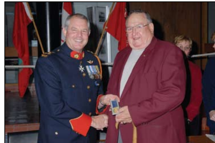
Brandon Police Service 125th Anniversary Medal Ceremony (all Members / Retired Members and Non-Sworn Employees of the Police Service)