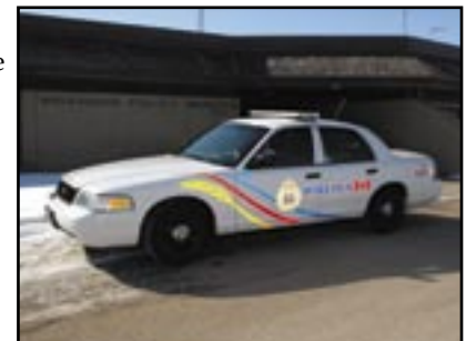
Leech Printing 149649

The nature of the complaint determines whether the Police Service or the Law Enforcement Review Agency will investigate it. All complaints outside the scope of the Law Enforcement Review Act are investigated by the Police Service.